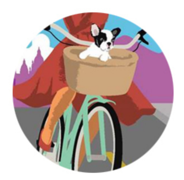
Bike Week: Taste of Pasdena Monday, May 13 6:30PM - 10:00PM Learn More »