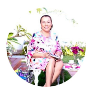
Music Emerging Workshop: The Crazybrave Artist Saturday, May 11 1:00PM - 3:00PM Lyd & Mo Studio & Gallery Sign Up »